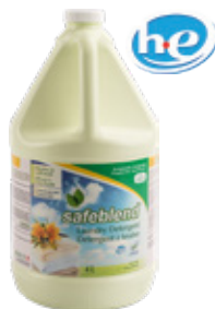
Floral fresh scent Code : LEFR