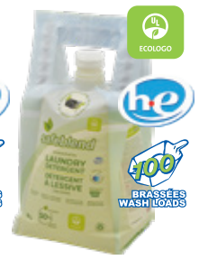
Floral fresh scent Code : LUFR