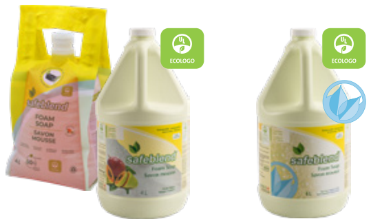
Mango Papaya Code : HFMP