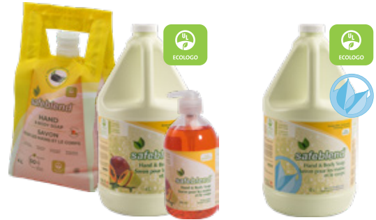
Mango Papaya Code : HLMP