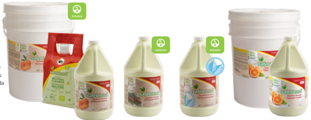
Tangerine oil Code : NCTO