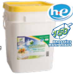
Floral fresh scent Code : LPFR