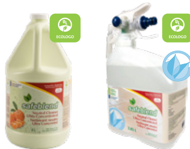
Tangerine oil Code : NUTO