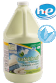
Fragrance free Code : LEXX