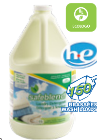
Fragrance free Code : LUXX