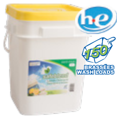
Lemon fresh scent Code : LPLE

These detergents are formulated to be used in HE washing machines. They are low-sudsing and quick dispersing for use in low water volume machines. HE detergents hold soil in suspension so it is not re-deposited onto clean clothes.